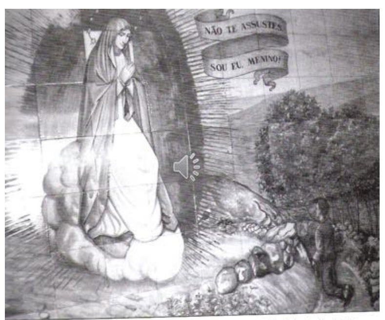
Azulejos em que se recorda a aparição de 11 de Maio de 1917.

simultaneous? Or do we decide that maybe by saying the same thing to so many at once Our Lady was trying to verify the apapritions and emphasize the importance of her message?