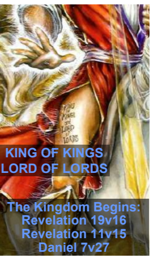
KING OF KINGS LORD OF LORDS The Kingdom Begins: Revelation 19v16 Revelation 11v15 Daniel 7v27

Jeremiah 30v7 - KJV Alas! for that day is great, so that none is like it: it is even the time of Jacob's Trouble; but he shall be saved out of it.