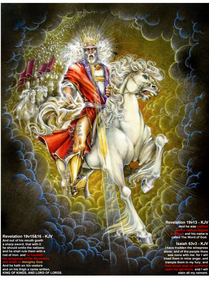
Revelation 19v13 - KJV And he was clothed with a vesture dipped in blood; and his name is called The Word of God. Isaiah 63v3 - KJV I have trodden the winepress alone; and of the people there was none with me; for I will tread them in mine anger, and trample them in my fury; and their blood shall be sprinkled upon my garments, and I will stain all my raiment.

Revelation 10v7 - KJV But in the days of the voice of the seventh angel, when he shall begin to sound, the mystery of God should be finished, as he hath declared to his servants the prophets. Revelation 11v15 - KJV And the seventh angel sounded; and there were great voices in heaven, saying, The kingdoms of this world are become the kingdoms of our Lord, and of his Christ; and he shall reign for ever and ever.