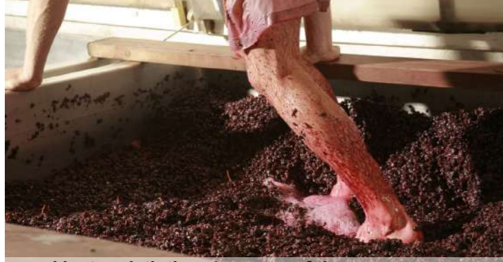
...and he treadeth the winepress of the fierceness and wrath of Almighty God. (Rev.19v15)

Isaiah 2v12 - KJV For the Day of the LORD of hosts shall be upon every one that is proud and lofty, and upon every one that is lifted up; and he shall be brought low: