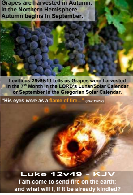
Grapes are harvested in Autumn. In the Northern Hemisphere Autumn begins in September.