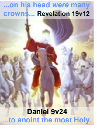
...on his head were many crowns... Revelation 19v12 Daniel 9v24 ...to anoint the most Holy.