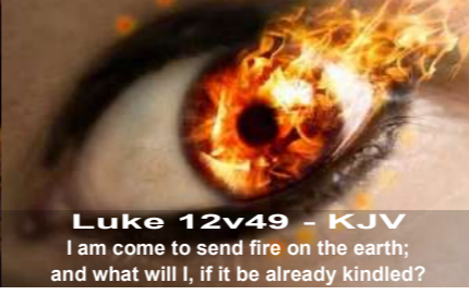
Luke 12v49 - KJV I am come to send fire on the earth; and what will I, if it be already kindled?