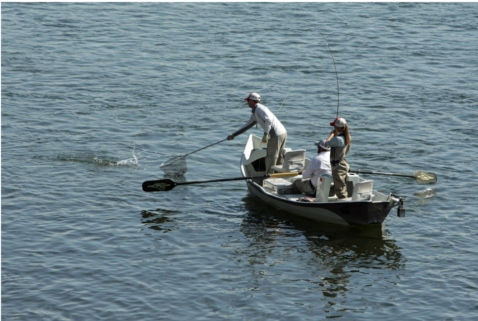
Floating from a boat allows you to cover more water than on foot

Afterbay Access – Three Mile Access - This 3 mile float is relatively short, but it is deceptive because there is a lot of productive water to cover, possibly the most productive 3 miles of trout water in the world and just about all of it is wadeable. This is a good option for those just looking to wade fish or for those looking for a shorter evening float. There is one hazard about a mile down from the dam called the Suck Hole, which essentially is a large eddy/whirlpool created by an old concrete impoundment. Floaters finding there way into this hazard can get in a lot of trouble. It is best to stay as far river left as possible.