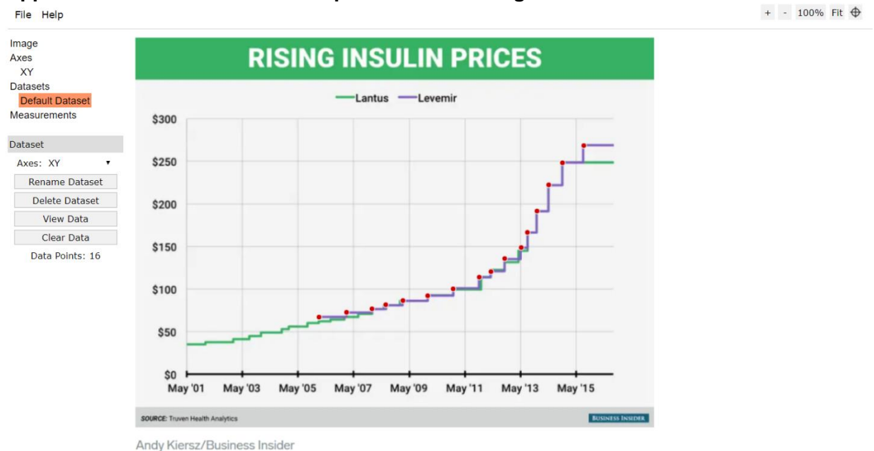
Figure 3 - Graph by Andy Kiersz/ data from Truven Health Analytics / Published in Business Insider (2016). Data collection shown by red dots taken with WebPlotDigitizer.