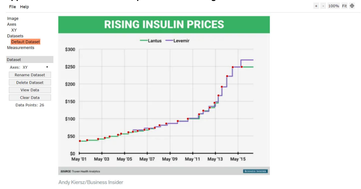
Figure 3 - Graph by Andy Kiersz/ data from Truven Health Analytics / Published in Business Insider (2016). Data collection shown by red dots taken with WebPlotDigitizer.