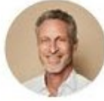
Mark Hyman, M.D. • @drmarkhyman

What you choose to eat every day is the single most important thing you can do to create health, spread social justice, repair the environment, and reverse climate change.