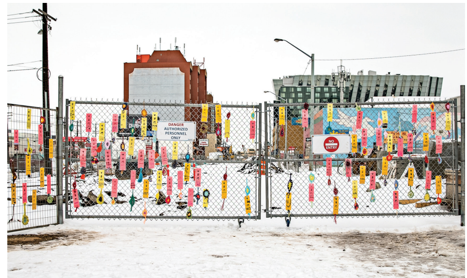
Above: Documentation of aiya哎呀's Harbin Gate events, aiya哎呀, 2018