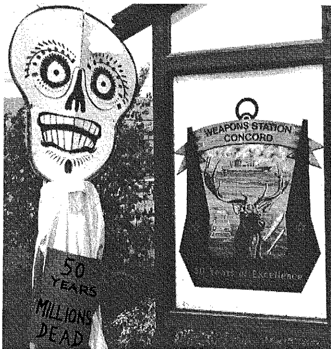
Your editor, prior to arrest, June 27, 1992

At least one person will continue to function as Site Supervisor, operating from the N.A. vehicle on the other side of the base gates. They will straighten up the site each morning, stock the literature table, maintain the munitions vehicle log, signs, vests and flags for blockers, and video camera, and be present at the site 2 times a day around the time of munitions trains to remove and replace the barriers as necessary. A sign will be placed at the literature table directing visitors to the camper for further assistance or information.