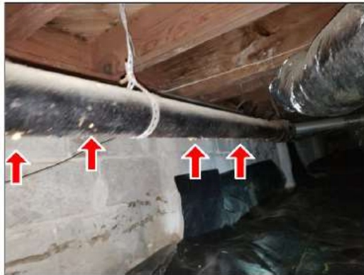
7.0 Item 4(Picture)