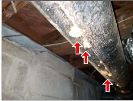
7.0 Item 2(Picture)