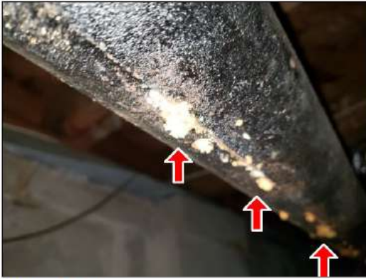
7.0 Item 1(Picture)