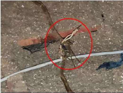
1.8 Item 1(Picture)

1.8 Exposed wiring needs placed in a junction box with a cover.