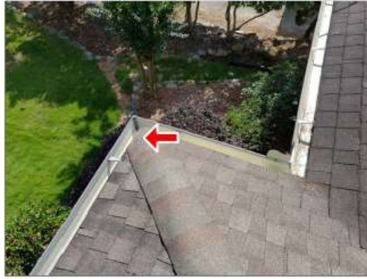
1.0 Item 2(Picture)