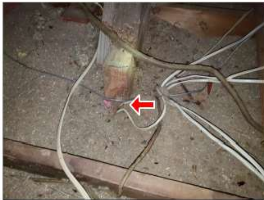
1.8 Item 4(Picture)

The roof of the home was inspected and reported on with the above information. While the inspector makes every effort to find all areas of concern, some areas can go unnoticed. Roof coverings and skylights can appear to be leak proof during inspection and weather conditions. Our inspection makes an attempt to find a leak but sometimes cannot. Please be aware that the inspector has your best interest in mind. Any repair items mentioned in this report should be considered before purchase. It is recommended that qualified contractors be used in your further inspection or repair issues as it relates to the comments in this inspection report.