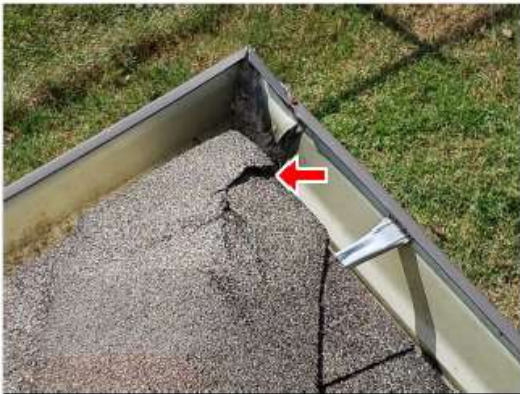
1.0 Item 3(Picture)