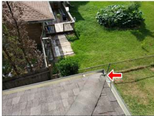
1.0 Item 4(Picture)