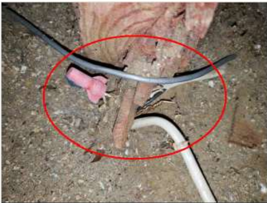
1.8 Item 3(Picture)