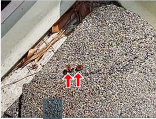
1.0 Item 1(Picture)