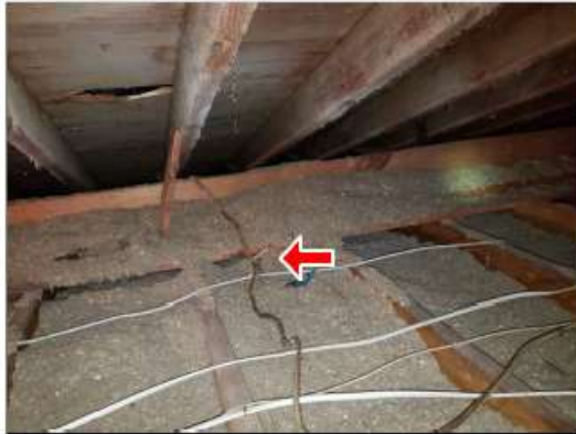
1.8 Item 2(Picture)