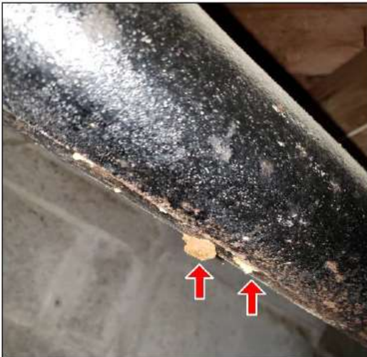
7.0 Item 3(Picture)