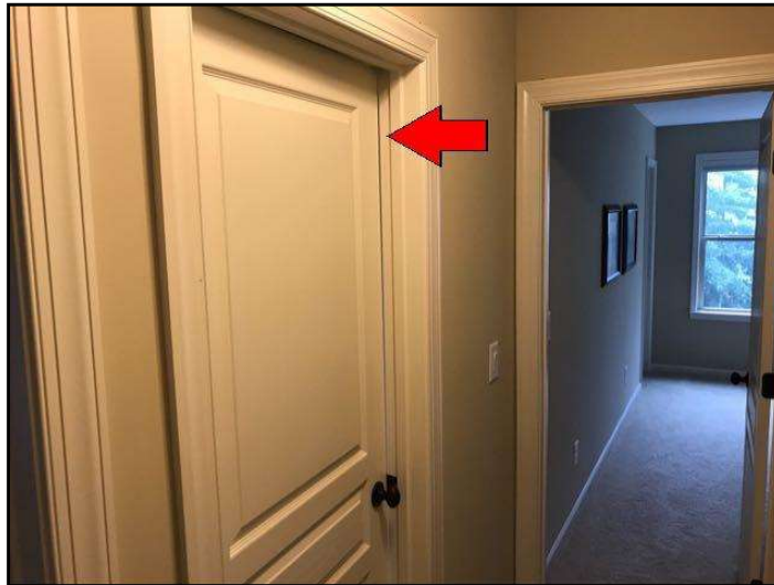
25. Poor Fit

16. Condition: • Does Not Latch Properly