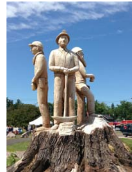
Miner's Watching over Ironwood