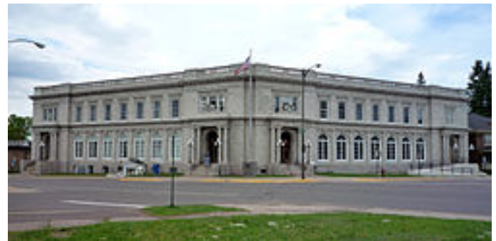
Ironwood Memorial Building 2013

The City currently enforces the 2009 International Building Code and related International Codes for Plumbing, Mechanical, and Fuel Gas and the 2006 International Residential Code. The 2005 National Electric Code governs all electrical work. The City has adopted the ICCA117.1-2009 Accessible and Usable Buildings and Facilities Standard for accessible design. The City has also adopted the ICC700-2008 Green Building Standards.