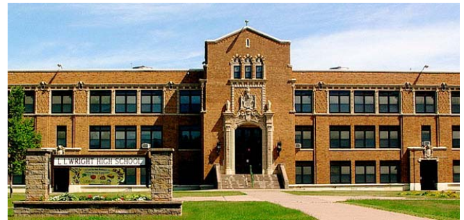
Luther L. Wright Middle-High School