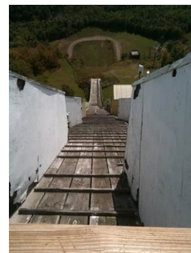
Looking down the jump at Copper Peak.

Recreational programs, facilities, and open space for residents of all age groups and abilities. With Ironwood being strategically located within miles of the Ottawa National Forest and the Porcupine Mountains, it comes to no surprise that the Ironwood area is one of the best Hiking and Biking locations in the United States. You can View beautiful water falls, valleys, bluffs, ravines, giant hills and ancient forests which will give you a unique appreciation of the wilderness that surrounds the area. (15 parks totaling more than 200 acres), indoor aquatic and walking facilities, and many acres of open space add to the action, attraction and beauty here. Lake Superior is located 18 miles from downtown Ironwood. It supports fishing, water sports, and canoeing, kayaking and other water-activities and is the largest freshwater lake in the country and is the LARGEST of the 5 Great Lakes.