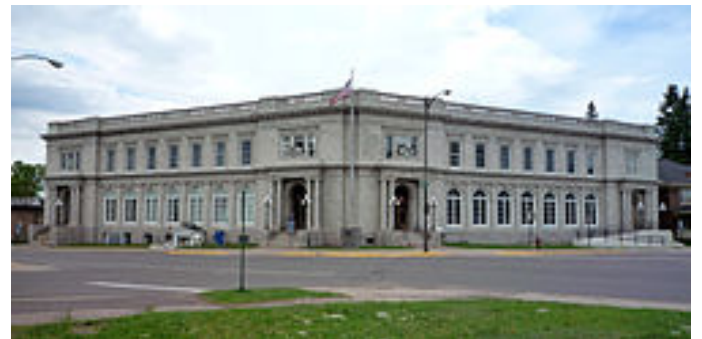
Ironwood Memorial Building 2013

The City currently enforces the 2009 International Building Code and related International Codes for Plumbing, Mechanical, and Fuel Gas and the 2006 International Residential Code. The 2005 National Electric Code governs all electrical work. The City has adopted the ICCA117.1-2009 Accessible and Usable Buildings and Facilities Standard for accessible design. The City has also adopted the ICC700-2008 Green Building Standards.