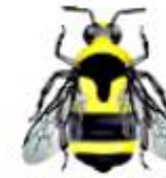
Nearctic Bumble Bee ( Bombus vanacouverensis nearcticus ) S5 Not tracked

B. vanacouverensis ssp Nearcticus Polymorphic Varied coloration & stripe patterns. Yellow or white markings The red-tailed is " B. bifarius "