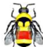
Tri-colored bumble bee ( Bombus ternarius ) S5 Not tracked