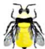
White-shouldered bumble bee ( Bombus appositus )