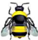
Yellow-banded bumble bee ( Bombus terricola ) S4, tracked