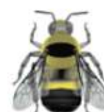
Yellow head bumble bee ( Bombus flavifrons ) S5 Not tracked