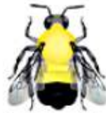
Confusing bumble bee ( Bombus perplexus ) S5 Not tracked