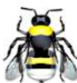
Cryptic bumble bee ( Bombus cryptarum ) SU, tracked