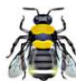
Ashton cuckoo bumble bee ( Bombus bohemicus ) S1, tracked