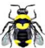
Suckley cuckoo bumble bee ( Bombus suckleyi ) S1 tracked