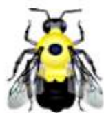
Two-spotted bumble bee ( Bombus bimaculatus )