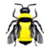
Yellow bumble bee ( Bombus fervidus ) S5 Not tracked