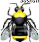
Indiscriminate cuckoo bumble bee ( Bombus insularis ) S4 tracked