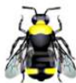
Fernald cuckoo bumble bee ( Bombus fernaldi ) S4 tracked