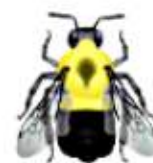
Common eastern bumble bee ( Bombus impatiens )