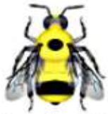
Sanderson bumble bee ( Bombus sandersoni ) S5 Not tracked