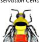
Black-tailed bumble bee ( Bombus melanopygus ) S5 Not tracked