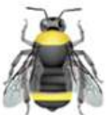
Yellow bumble bee 2 ( Bombus fervidus ) S5 Not tracked