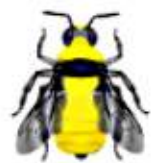
Northern amber bumble bee ( Bombus borealis ) S5 Not tracked

Adapted from Bumble Bee Field Guide Bumble Bee Watch