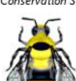
Fuzzy-horned bumble bee ( Bombus mixtus ) S5 Not tracked