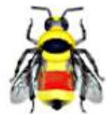
Forest bumble bee ( Bombus sylvicola ) S5 Not tracked