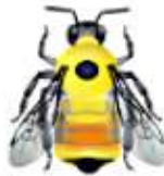
Red-belted bumble bee ( Bombus rufocinctus ) S5 Not tracked