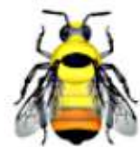
Central bumble bee ( Bombus centralis ) S5 Not tracked