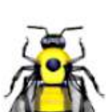
Nevada bumble bee ( Bombus nevadensis ) S5 Not tracked