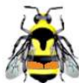
Two-form bumble bee ( Bombus bifarius )