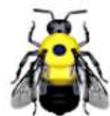
Brown-belted bumble bee ( Bombus griseocollis ) SU tracked