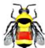
Hunt's bumble bee ( Bombus huntii ) S5 Not tracked