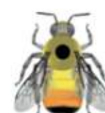
Yellow head bumble bee 2 ( Bombus flavifrons ) S5 Not tracked

Adapted from Bumble Bee Field Guide Bumble Bee Watch