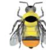
Frigid Bumble Bee ( Bombus frigidus ) S5 Not tracked