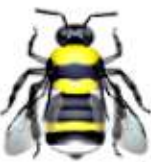
Western bumble bee ( Bombus occidentalis ) S2, tracked