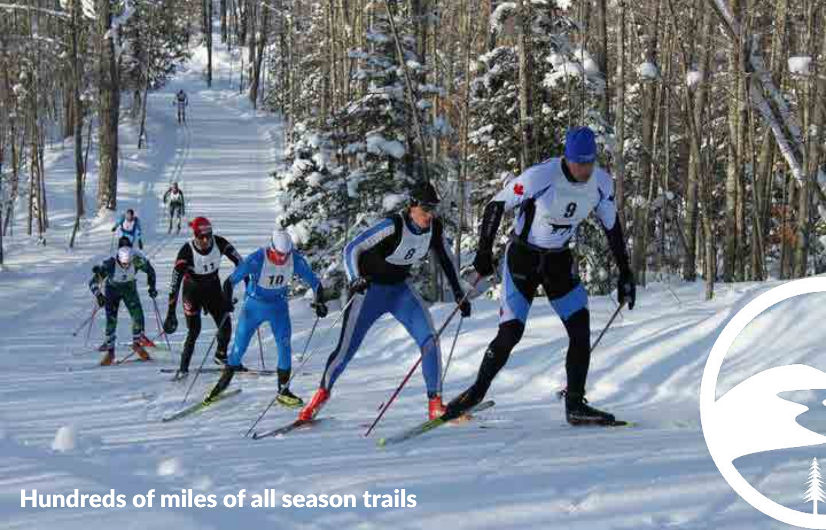
Hundreds of miles of all season trails