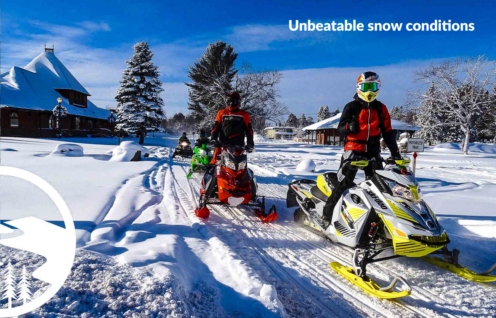
Unbeatable snow conditions