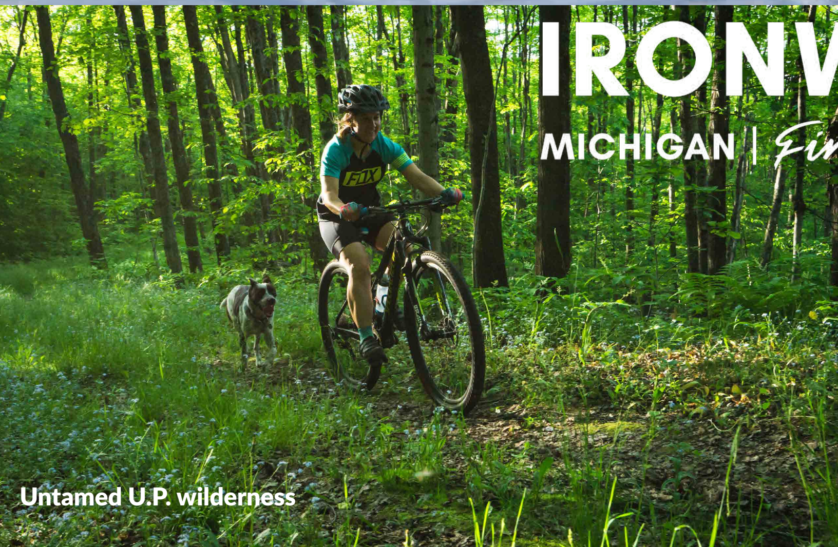
Untamed U.P. wilderness