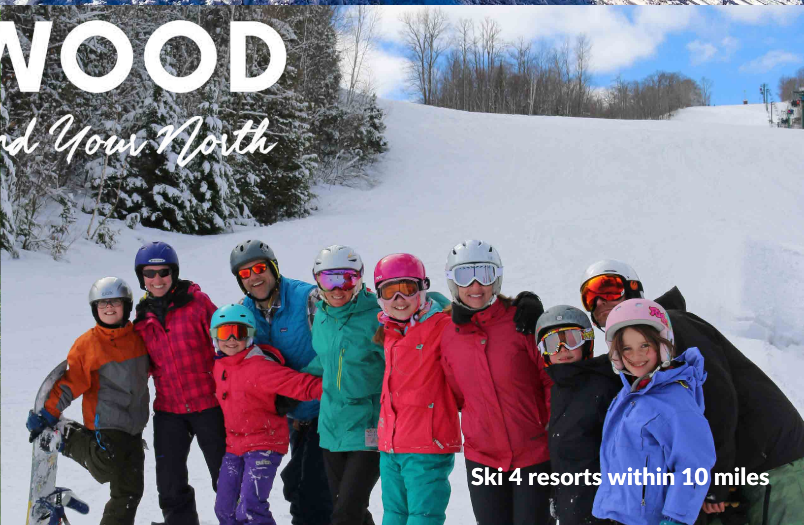
Ski 4 resorts within 10 miles