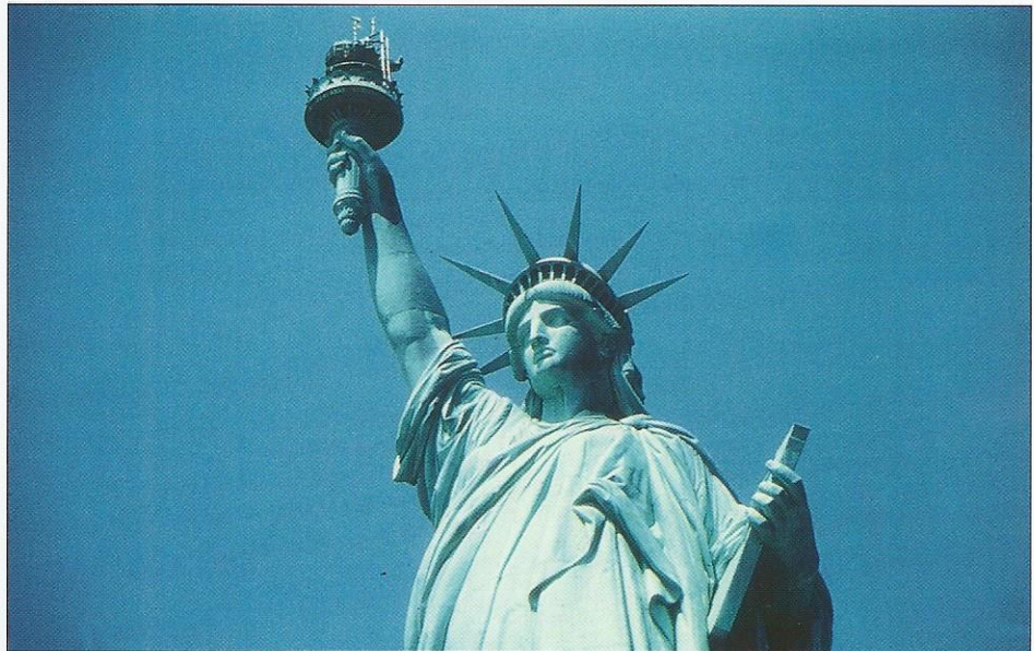
The Statue of Liberty.

The United States has been considered a "nation of immigrants," a place where diverse people could work together to build a strong, prosperous nation. As immigration patterns and profiles have changed—from predominantly white Europeans through the 1960s to predominantly people of color from throughout Asia, Latin America, the Caribbean and Africa today—the U.S. educational system has failed to build bridges of understanding, experience, and respect between new immigrant groups and more established populations. It was to meet this critical, growing need that "Americans All" was developed to respond