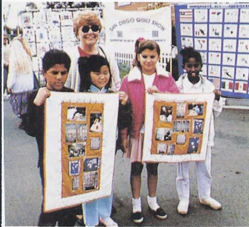
Above: Community, the school and parents get together to exhibit these beautiful quilts that illustrate each child's family and cultural heritage in San Diego. This program was part of the Americans All project, a multi-cultural education program.

Commenting on the program, one teacher in San Diego said, "Most of my students had no understanding of their own family heritage or any appreciation for the role of immigrants in building America. This is the most outstanding curriculum project in this area that I have ever used."