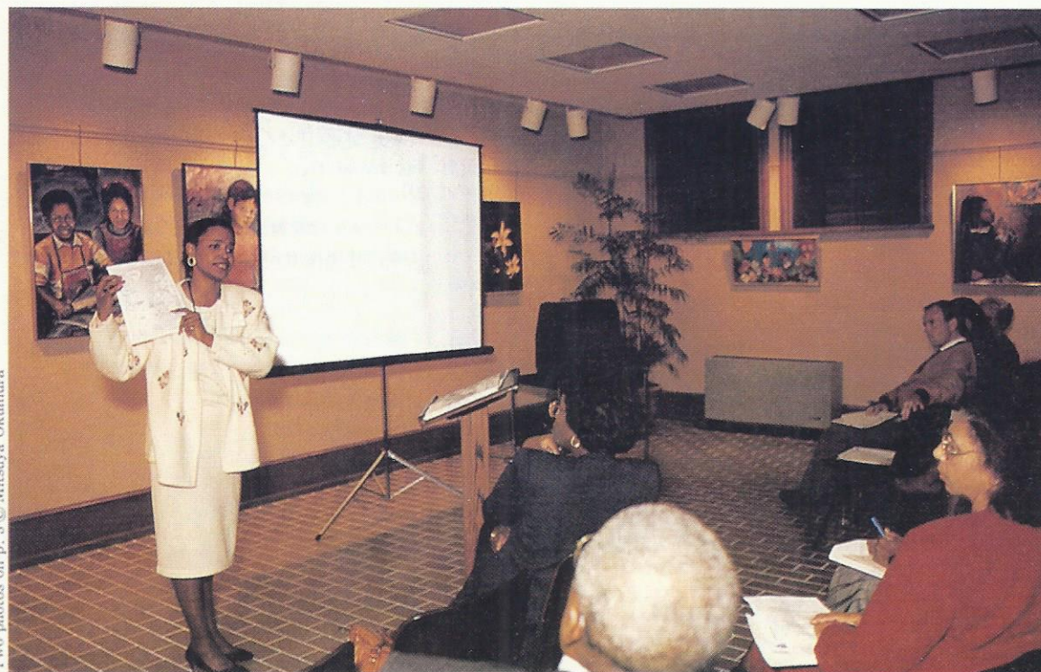
Two photos on p. 5 © Mitsuya Okumura