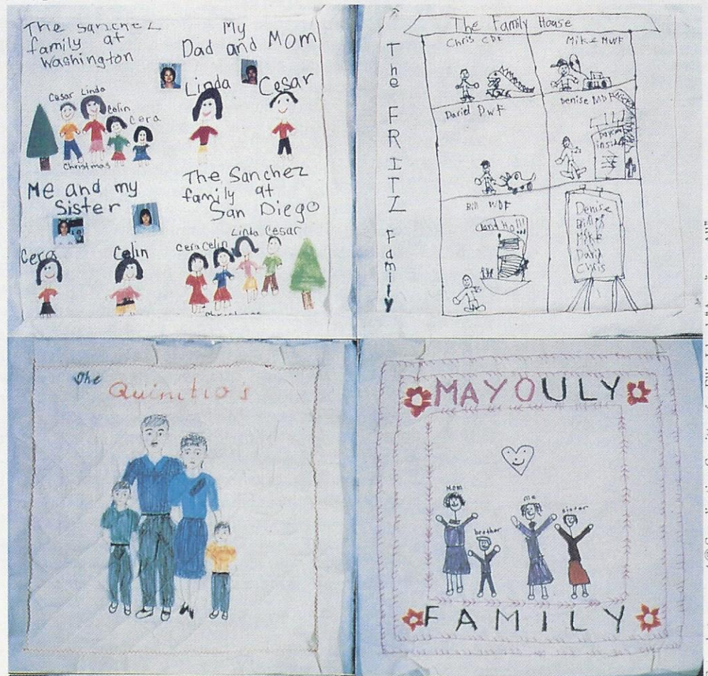
Four photos on p. 4 © Coordinating Committee for Ellis Island - Americans All

「家族」をテーマにした、子供たちのキルト作品。描いたり、刺繍したり、写真を貼ったり自由に工夫している。