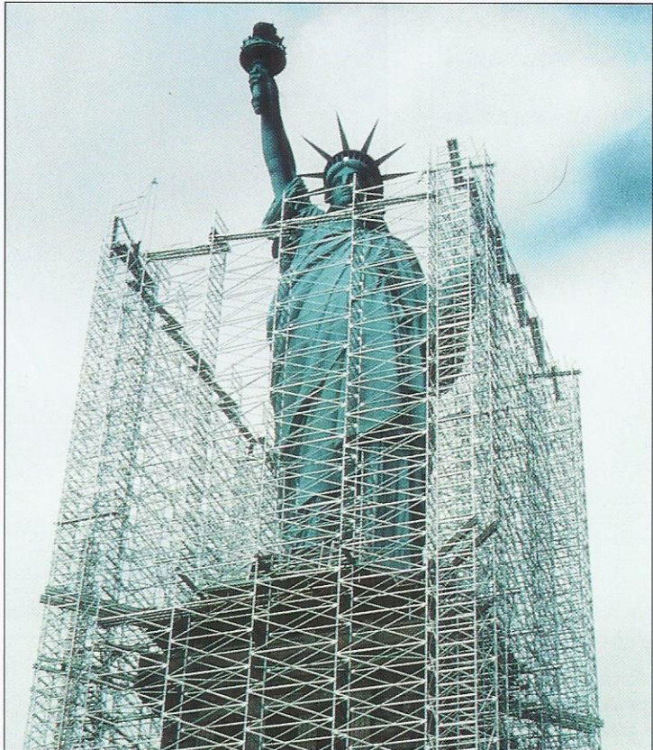
(TOP) The Statue of Liberty.