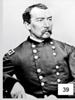
8. First Battle of Memphis, June 6, 1862; 23. David Farragut, c.1862-64; 26. Ambrose E. Burnside, c.1865-80; 27. William Starke Rosecrans, c.1860-65; 28. Braxton Bragg, c.1861-65; 29. Battle of Stones River, December 31, 1862 to January 2, 1863; 30. Battle of Chancellorsville, April 30-May 1, 1863 and death of (31) Jackson; 31. Thomas Jonathan "Stonewall" Jackson, 1862; 32. George Gordon Meade, c.1855-65; 33. George Henry Thomas, c.1855-65; 35. Joseph Hooker, c.1861-65; 37. James Glasgow Farragut, c.1862-64; 39. Philip Henry Sheridan, c.1860s;