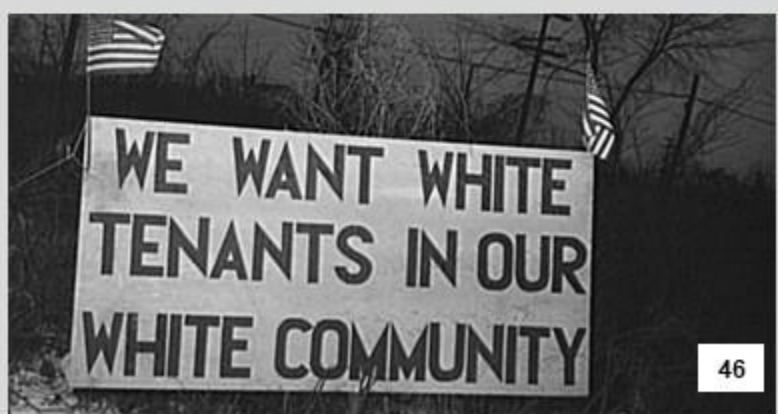
6. Main building #7, Great Chicago Sanitary Fair, May 30, 1865; 19. Battle of Nashville, December 15-16, 1864; 20. John Bell Hood, n/d; 38. Emancipation Proclamation, January 1, 1863; 41. Edmund Kirby Smith, c.1861; 42. Andrew Johnson, c.1870-80; RECONSTRUCTION 43. Freedmen's Bureau office in Memphis, TN, 1866; Harper's Weekly, New York Public Library; 44. Freedmen Voting in New Orleans, 1867; JIM CROW LAWS 45. Segregated drinking fountain, OK, July 1939; 46. Housing Project sign, Detroit, February 1942.