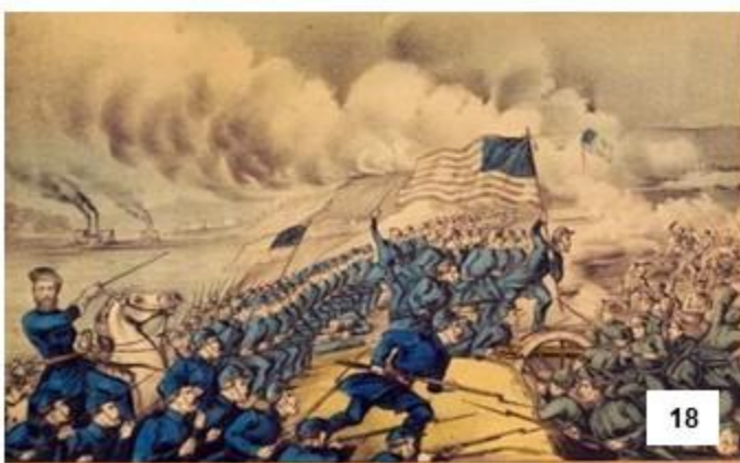
2. Alexander H. Stevens, c.1865-80; 5. Robert Anderson, c.1860-65; 9. Albert Pike, c. 1865-80; 10. William Harvey Carney, c.1901-08; 11. Harriet Tubman, 1895; 12. Annie Wittenmyer, n/d; 13. Mary Ann Bickerdyke, 1863; 14. Clara Barton, 1904; 15. Mary Livermore, 1867; 16. Edwin McMasters Stanton, c.1855-65; 18. Storming of Fort Donelson, February 15, 1862; 22. Panoramic View of New Orleans, Federal Fleet at Anchor in the River, c.1862;