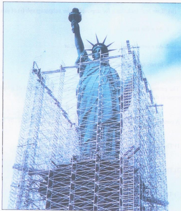
(TOP) The Statue of Liberty. The Americans All Photograph Collection. Americans All: A National Education Program , from the collections of the Statue of Liberty National Monument and Visual Horizons.