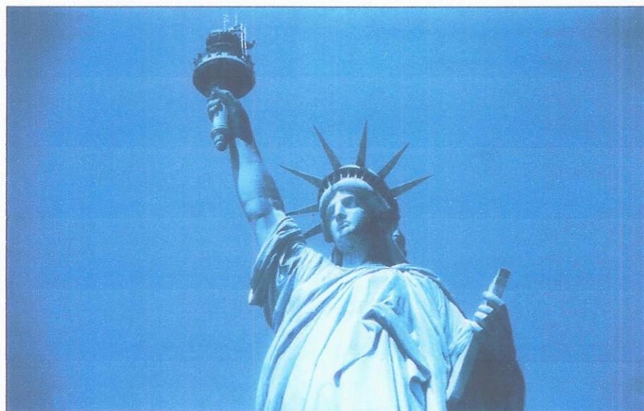
The Statue of Liberty. The Americans All Photograph Collection. Americans All: A National Education Program, Portfolio Project, from the collection of The First Experience, Inc.

The United States has been considered a "nation of immigrants," a place where diverse people could work together to build a strong, prosperous nation. As immigration patterns and profiles have changed — from predominantly white Europeans through the 1960s to predominantly people of color from throughout Asia, Latin America, the Caribbean and Africa today — the U.S. educational system has failed to build bridges of understanding, experience, and respect between new immigrant groups and more established populations. It was to meet this critical, growing need that "Americans All" was developed to respond