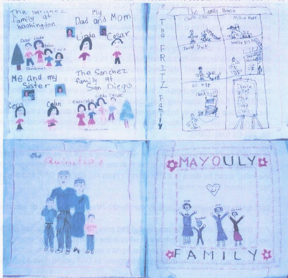
Four photos on p. 4 © Coordinating Committee for Ellis Island "Americans All"

「家族」をテーマにした、子供たちのキルト作品。描いたり、刺繍したり、写真を貼ったり自由に工夫している。