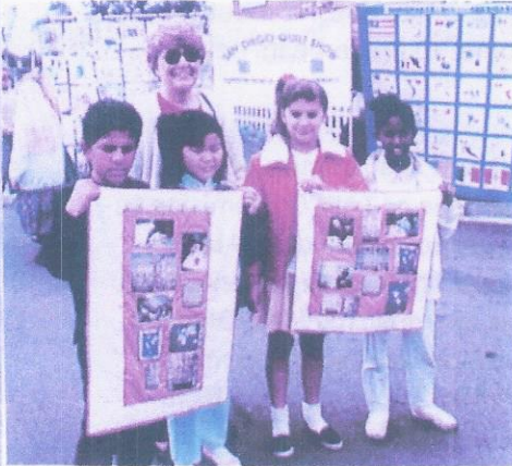
Above: Community, the school and parents get together to exhibit these beautiful quilts that illustrate each child's family and cultural heritage in San Diego. This program was part of the Americans All project, a multi-cultural education program.

The Hitachi Foundation was founded in 1985 in celebration of the 75th anniversary of Hitachi, Ltd. Today, it is one of the best known of the approximately 20 foundations that have been established in the United States by Japanese companies.