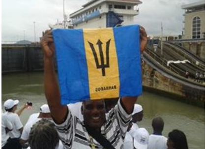
One of the groups