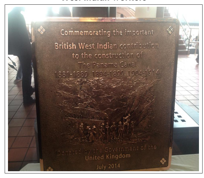
Excerpted from The Panama News.

On July 17, 2014 Her Majesty's Government and the Panama Canal Authority afforded a bit of redress to West Indian Canal construction workers.