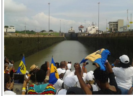
Transiting the Canal

In our October 2013 Newsletter we presented "An up-hill fight for Recognition" in which we mentioned ASEAP's work to bring recognition to Black Ethinic groups. Saturday, August 16, 2014 saw them offering free consultations: legal and medical within the Vereda Afro-Antillana (formerly Sidney Young Park) at the corner of 13 Street Rio Abajo all day. Congratulations!!! They promise other such activites in the future.